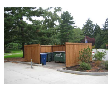
Music Building/Clark Hall Shared Enclosure

16' wide, 20' deep; approximately 320 square feet