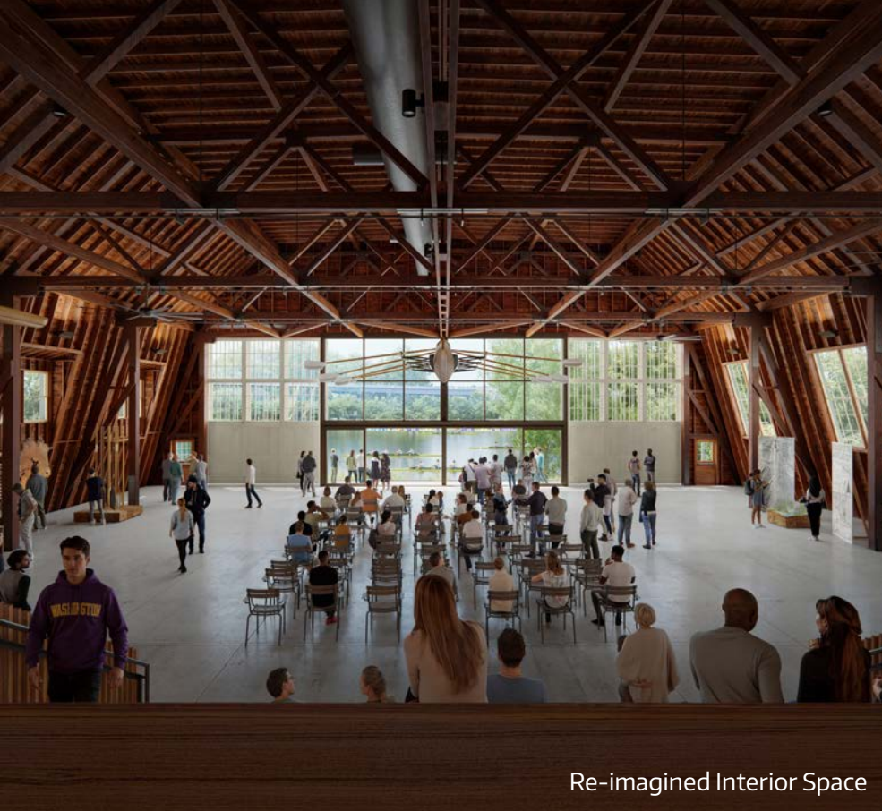
Re-imagined Interior Space