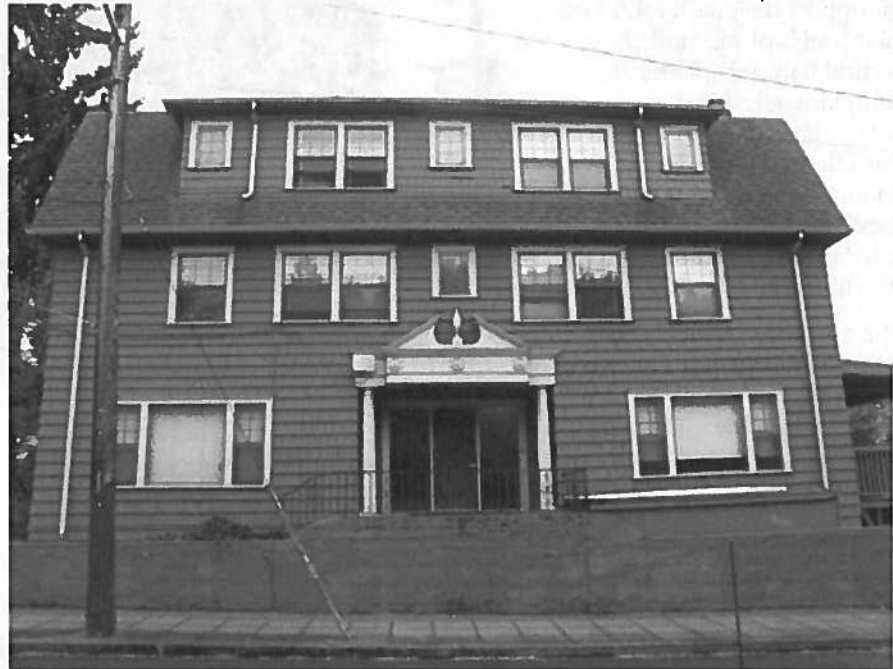
The southern Façade.

round columns flanking the recessed entry. The entry door is flanked by two tall original divided-light side-lights. The porch roof features a broken pediment with a central vase. The entry is flanked by two tripartite windows, with a large central window flanked by narrower outer windows. The second floor has a small window centered on the porch roof below flanked by pairs of double-hung windows with single double-hung windows at the outer ends. These outer windows are each centered above the tripartite windows below. The third-floor dormer has a central small window flanked by pairs of double-hung windows with smaller windows at the outer ends.