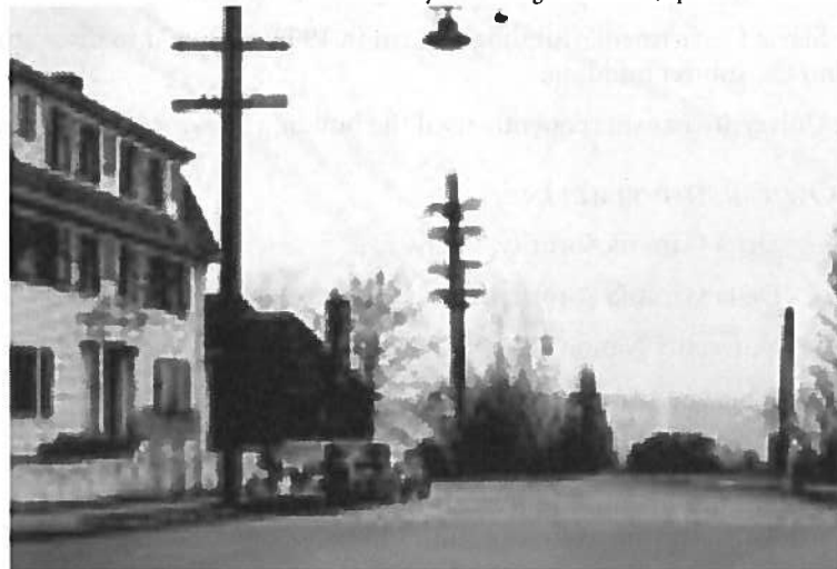
Subject building in 1938 just before the viaduct was started.