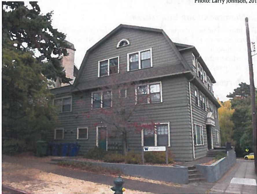
Viewing from the southwest.