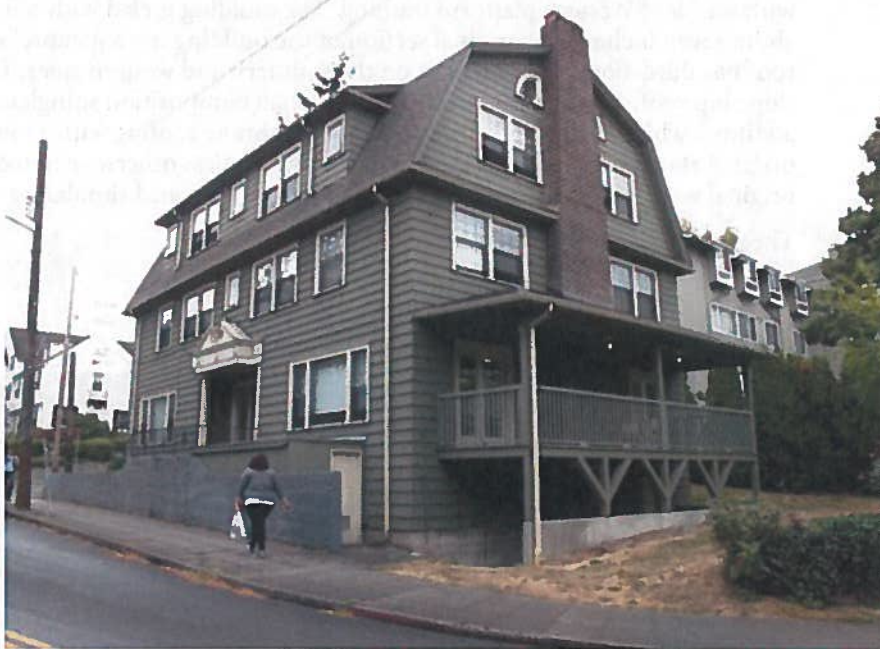
Viewing from the southeast.