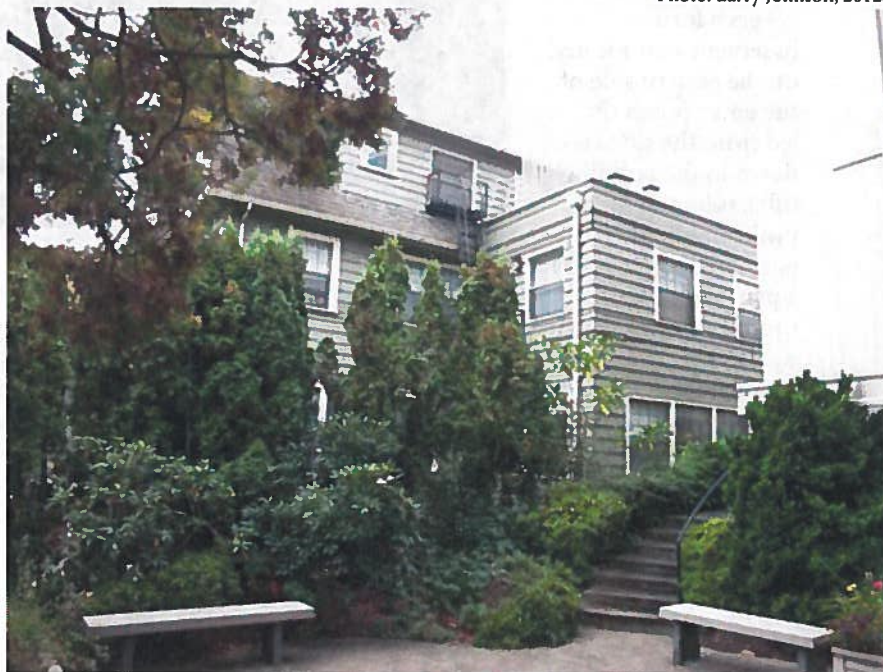
Viewing from the northeast.