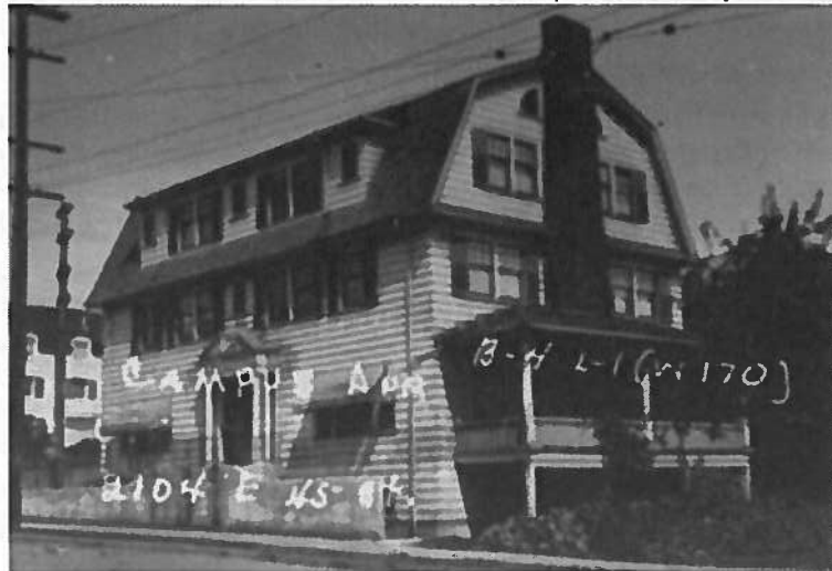
Subject building in 1936 with the reconfigured front porch.

Due to the smaller size of the building's new lot, the original brick stoop and projecting entry porch supported by trios of columns was replaced by a shallower porch roofed with an abbreviated broken-pediment architrave supported on four classical Doric columns possibly salvaged from the original porch. The entrance stairs were modified to be parallel with the entrance façade, with the western approach leading to the entry porch and an eastern approach leading to the basement, rather than the original perpendicular approach arrangement. 20