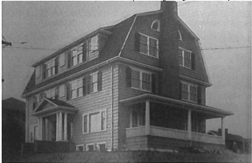
Subject building at its original location — 2012 E 45 th Street, circa 1919.