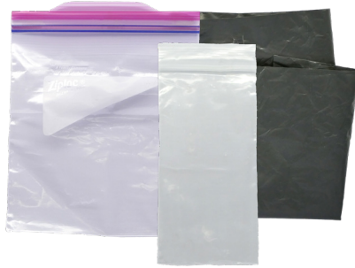
Bags & Other Plastic Film