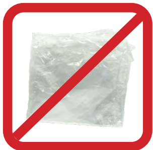
No Crinkly & Rigid Plastic Film

If you can stretch the plastic easily with your thumb, it is most likely recyclable.