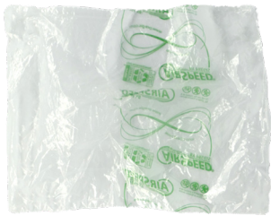
Air Pillows (deflated)