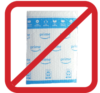
No Bubble Mailers