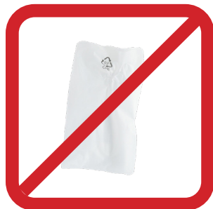
No #7 Plastic