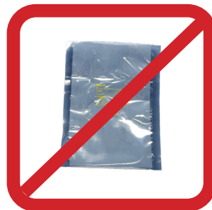
No Mylar or Foil